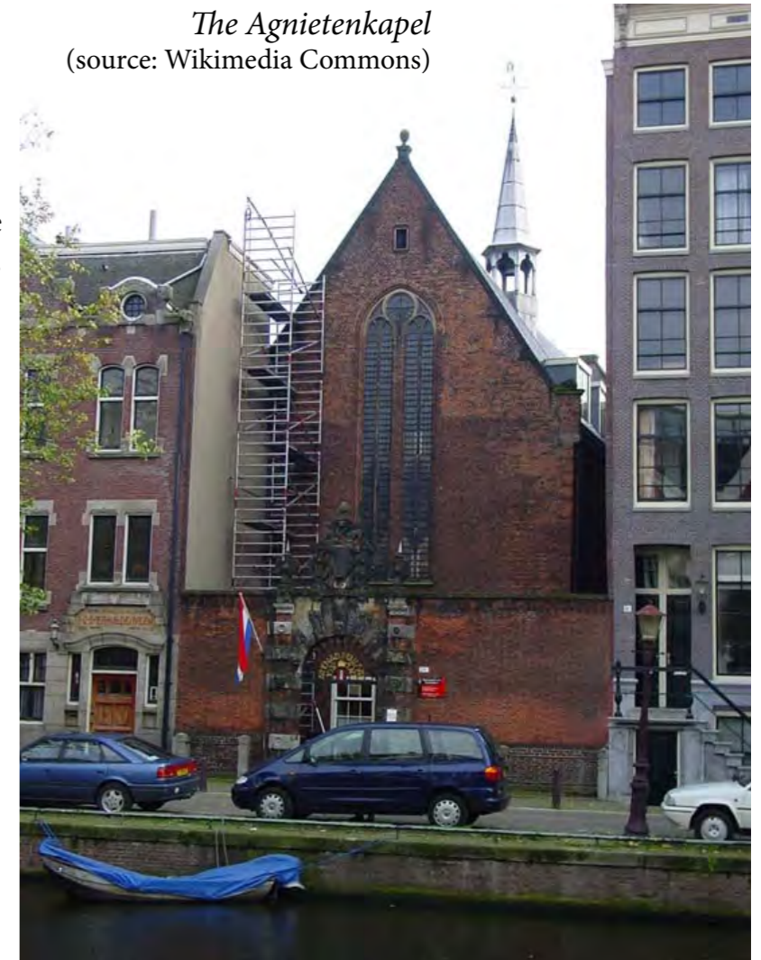
The Agnietenkapel